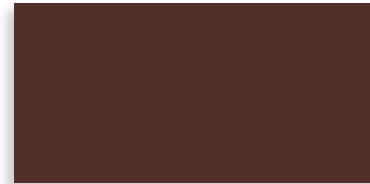
*Burgundy TSR = .26

131 Industrial Park Extension, Belington, WV 26250 Phone: (304) 823-3771 • Website: www.lifetite.com