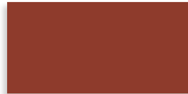
*Barn Red TSR = .35